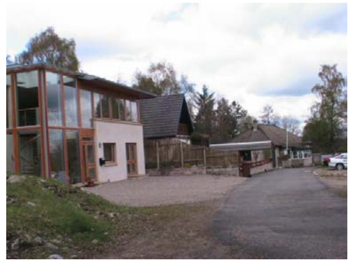
Fig. 4 : Existing properties at Highburnside

4. Prior to the commencement of development works on the site the land consisted primarily of birch woodland, interspersed with stands of aspen. It also included some limited areas of grazing land, as well as encompassing an area formerly used as the Highburnside Caravan The eastern boundary of the proposed site is formed by the A9 Park. trunk road, and to the north, south and west boundaries are framed by existing woodland (including Kinveachy Forest, which is a designated Special Protection Area and Special Area of Conservation). The site also lies adjacent to the Cairngorm Mountains National Scenic Area and Craigellachie NNR and SSSI. The land gradually rises in a westerly direction from the A9, with a 30 metre rise in ground levels from the eastern to the western boundaries of the site. The Aviemore Burn flows through the southern areas of the site, in an easterly direction. A network of informal tracks and paths have existed around the site for guite some time and the permitted masterplan layout makes provision for the retention, and in some instances the increased formalisation, of some of the paths.