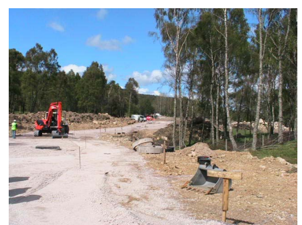
Fig. 3 : Southern area of the site – access road serving plots 46 – 75.

4. Prior to the commencement of development works on the site the land consisted primarily of birch woodland, interspersed with stands of aspen. It also included some limited areas of grazing land, as well as encompassing an area formerly used as the Highburnside Caravan The eastern boundary of the proposed site is formed by the A9 Park. trunk road, and to the north, south and west boundaries are framed by existing woodland (including Kinveachy Forest, which is a designated Special Protection Area and Special Area of Conservation). The site also lies adjacent to the Cairngorm Mountains National Scenic Area and Craigellachie NNR and SSSI. The land gradually rises in a westerly direction from the A9, with a 30 metre rise in ground levels from the eastern to the western boundaries of the site. The Aviemore Burn flows through the southern areas of the site, in an easterly direction. A network of informal tracks and paths have existed around the site for guite some time and the permitted masterplan layout makes provision for the retention, and in some instances the increased formalisation, of some of the paths.