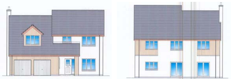
Fig. 14 : House type N – front and rear elevations

15. House type N is a detached two storey property, designed in a split level format and incorporating a double garage. It has a floor area of 213 square metres and includes 5 bedrooms, as well as an open plan library area at first floor level. Ground floor accommodation includes a kitchen / family room with utility, separate dining room and a lounge. Vertical timber cladding is proposed for detailing in a number of areas. An external chimney breast is proposed on the side elevation.