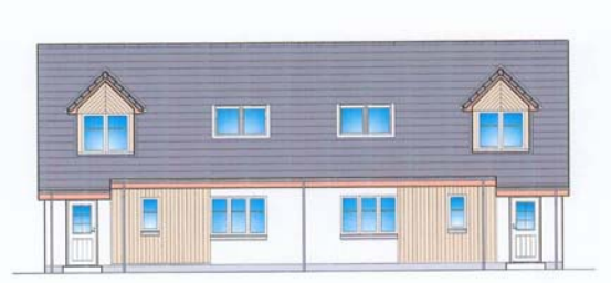
Fig. 13 : House type M, front elevation of semi detached structures

15. House type N is a detached two storey property, designed in a split level format and incorporating a double garage. It has a floor area of 213 square metres and includes 5 bedrooms, as well as an open plan library area at first floor level. Ground floor accommodation includes a kitchen / family room with utility, separate dining room and a lounge. Vertical timber cladding is proposed for detailing in a number of areas. An external chimney breast is proposed on the side elevation.