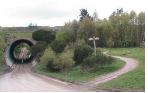
Fig. 5 : Milton Underpass providing access to the area at present.