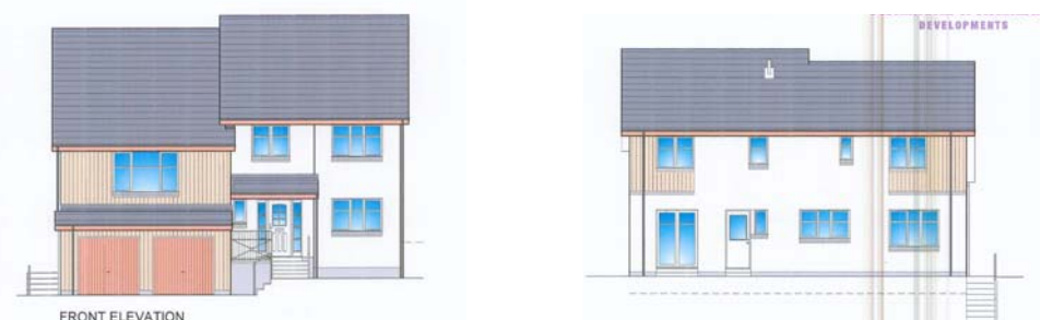
Fig. 15 : House type P – front and rear elevations

16. House type P is a 4 bedroom detached structure with an integral double garage. The two storey form has an internal split level layout, so that the floor level at the rear of the house is significantly higher than at the front elevation. Half of the front elevation is proposed to be clad with vertical timber, with the remainder having a render finish.