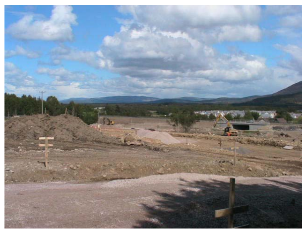
Fig. 2 : View eastwards towards proposed northern plots, with A9 beyond