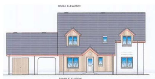
Fig. 8 : House type D (cp) front elevation