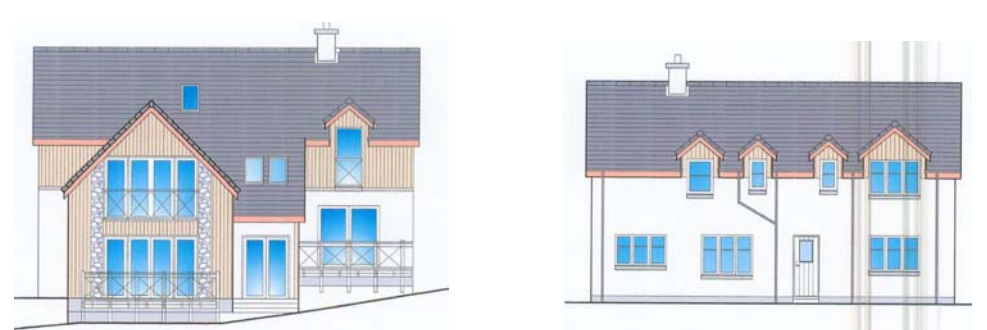
Fig. 11 : House type J – front and rear elevations

13. House type K has also been designed as a split level property and occupies a similar floor area as house type J (210 sq.m.). The front elevation has the appearance of a one and a half storey property, whilst the rear elevation is a two storey form. The T shape structure includes similar design features to House type J, including floor to ceiling windows in the rear gable projection, French doors opening onto decked areas and small non functional balconies at first floor level. The finishes include a combination of render and vertical timber cladding, as well as an external stone chimney breast. A total of four House type K structures are proposed, on plot numbers 4,5, 25 and 26, all of which occur in the more northerly area of the subject site. Detached garages are also proposed at three of the plots (5, 25 and 26) while the site layout plan shows a double garage attached to the main dwelling house on the remaining Type K plot (no. 4).