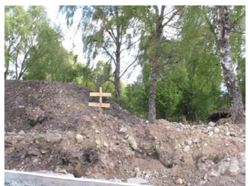
Fig. 19: Soil heaps in close proximity to trees in the western area of the site.