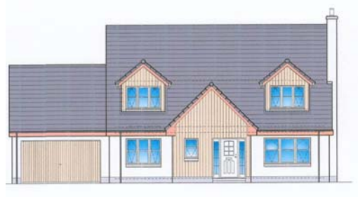
Fig. 10 : House type H

12. House type J is a split level dwelling, which is predominantly a one and three guarter storey design, with a floor area extending to 210 square The structure is an L shape, with a two storey projecting metres. section extending in the front elevation. This section incorporates vertical timber cladding on the façade, together with some stonework detailing alongside the floor to ceiling windows serving a lounge and family room, at ground floor and first floor respectively. French doors are proposed at the centrally positioned front entrance. A further set of double doors are located to the right of the entrance area, providing access to a decked and railed area from the kitchen / living area. The floor layout incorporates 4 bedrooms, a study, lounge, separate family room, and a kitchen / dining / living room. A total of four type J properties are proposed in the northern area of the site, on plot numbers 6, 22, 23 and 24. In addition the latter three plots also include detached garages.