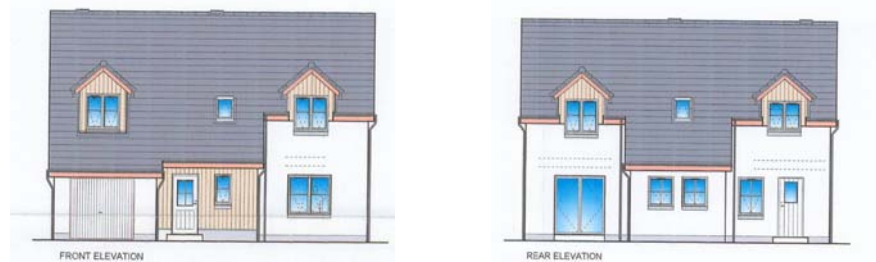
Fig. 6 : House type A – Front and rear elevations

8. House type A is a one and three quarter storey detached design, accommodating three bedrooms, as well as an integral garage. It has a floor area of 133 square metres, excluding the garage. Vertical timber cladding is used for detailing in the area surrounding the front entrance, as well as around the dormer windows on the front and rear elevations. The roof in the front elevation has a dominant effect, as it extends a considerable length below the first floor windows, particularly over the garage area. A total of six House type A structures are proposed (plot numbers 46, 49, 51, 69, 74 and 75).