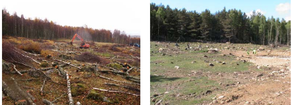
Figs 17 and 18 : Northern hillside area of the site