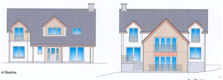
Fig. 12 : House type K – front and rear elevations

13. House type K has also been designed as a split level property and occupies a similar floor area as house type J (210 sq.m.). The front elevation has the appearance of a one and a half storey property, whilst the rear elevation is a two storey form. The T shape structure includes similar design features to House type J, including floor to ceiling windows in the rear gable projection, French doors opening onto decked areas and small non functional balconies at first floor level. The finishes include a combination of render and vertical timber cladding, as well as an external stone chimney breast. A total of four House type K structures are proposed, on plot numbers 4,5, 25 and 26, all of which occur in the more northerly area of the subject site. Detached garages are also proposed at three of the plots (5, 25 and 26) while the site layout plan shows a double garage attached to the main dwelling house on the remaining Type K plot (no. 4).